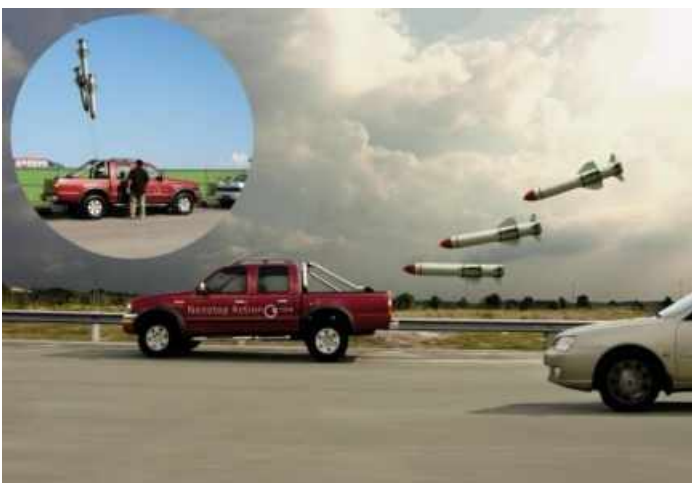
Rocket Balloons - Amuse your friends and local CHP...J